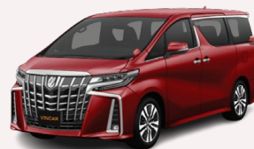
Dark Red Mica Metallic