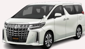
White Pearl Crystal Shine