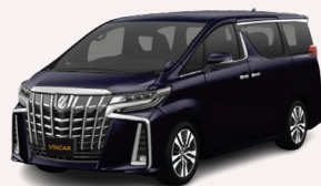
Sparkling Black Pearl Crystal Shine