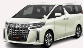
Luxury White Pearl Crystal Shine Glass Flake