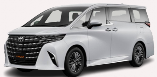
Platinum White Pearl Mica (089)